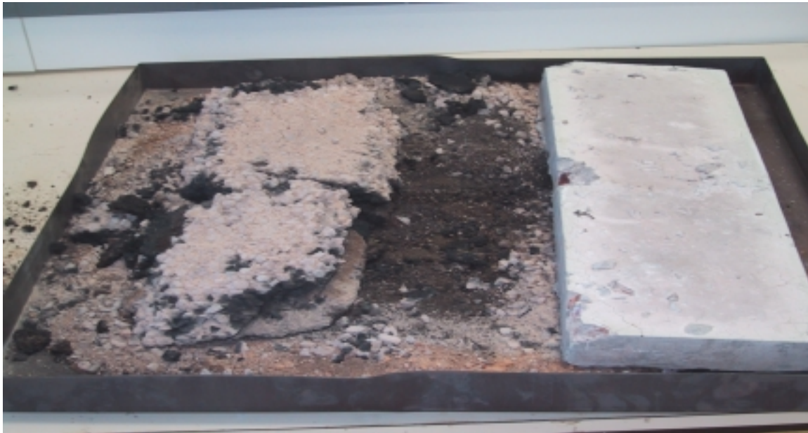
Figure 1 Comparison of specimens of asphalt (left) and concrete (right) after heating to 750°C

Figures 1 & 2 shows the results of the test consisting in heating in an oven during one hour prismatic specimens of asphalt (left) and concrete (right) to a temperature of 750°C according to the ISO curve.